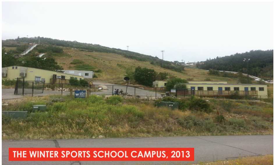
THE WINTER SPORTS SCHOOL CAMPUS, 2013

We are excited for the future of the Winter Sports School in Park City and the opportunity it will bring to our children. It will be a testament to our community's support of their athletic dreams and academic pursuits.