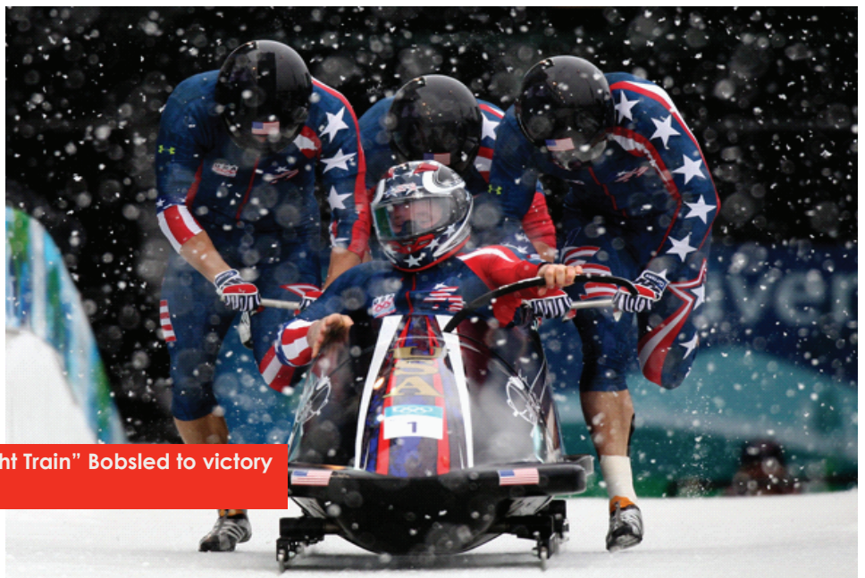
Steve Holcomb prepares to pilot the USA "Night Train" Bobsled to victory at the 2010 Vancouver Olympics.

Four-Man Bobsled Gold Medalist - Vancouver Winter Olympics